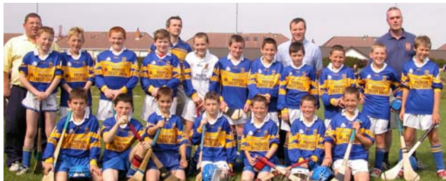
UNDER 11 CAMAINT TEAM