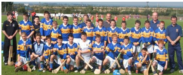
UNDER 12 CAMAINT TEAM

In a closely fought final, Castleknock's Under 12 boys were edged out by Ballinteer St. John's for the A division title which was hosted by the Commercials GAA Club in Rathcoole.