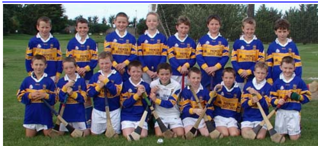
UNDER 10 CAMAINT TEAM